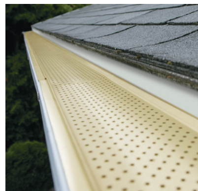
GUTTER PROTECTION SYSTEMS