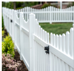
FENCE & RAILING